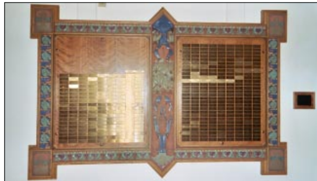
North Carolina Land Title Association is among other associations and companies recognized by the Grove Park Inn and Resort on a plaque in the latter's Vanderbilt Wing for holding the NCLTA 1999 annual convention during the Resort's Spa construction.