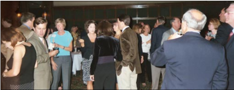
A crowd of nearly 80 convention attendees mingle during cocktails preceding the banquet on Friday evening.