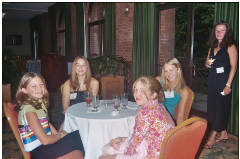
Convention delegates mingle during opening reception